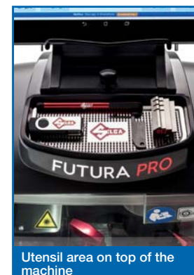
Utensil area on top of the machine

All exposed screws are made of stainless steel for better resistance to wear and a longer life. The machine is equipped with 2 USB ports at the rear: one for the tablet battery charger and one for the tethering connection so