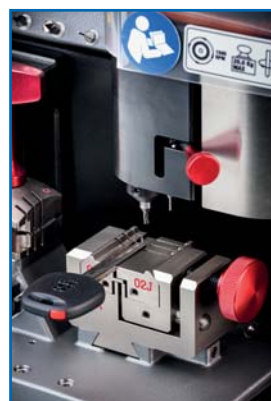
Laser and dimple key cutting station