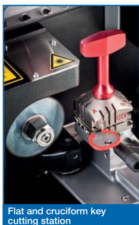
Flat and cruciform key cutting station

Futura Pro is controlled by a removable, 10" touch-screen tablet, which guides the user step-by-step in all key cutting operations (for example in selecting the correct key profile of a cylinder key, the make, model and year for vehicle keys, in the choice of the right cutter, clamp, etc.). The tablet integrates Silca Software's main functions