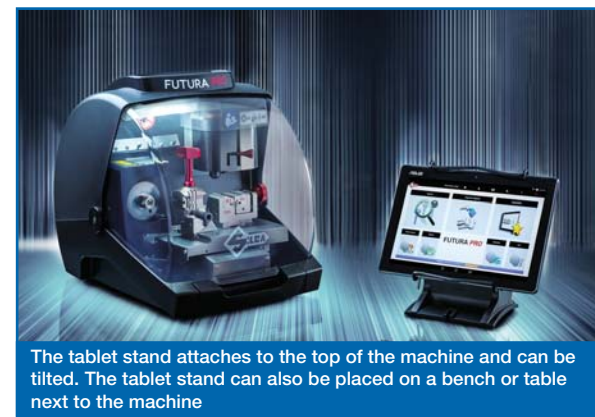
The tablet stand attaches to the top of the machine and can be tilted. The tablet stand can also be placed on a bench or table next to the machine

Silca prides itself not only on the outstanding quality of its products but also on their unique design. Futura Pro's "total black" new look is both distinctive and stylish. Revamped details include the new tool holder mat on the top of the machine and the protective motor cover made of polished steel.