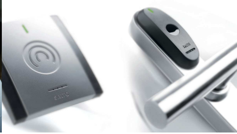
XS4 Wall Reader and escutcheon