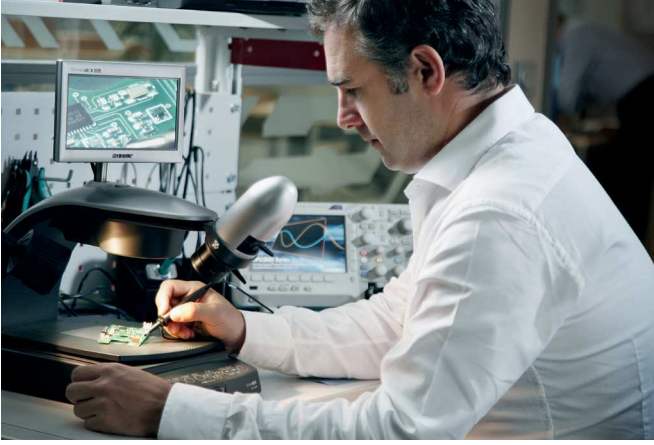
Component testing in development