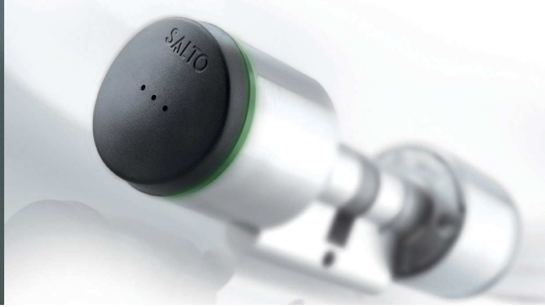
XS4 GEO cylinder