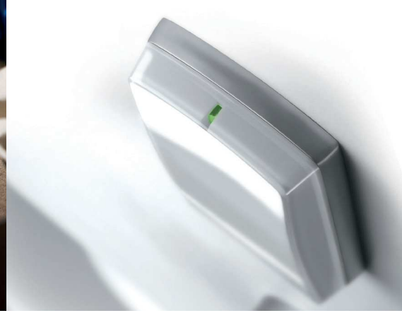
AEElement RFID lock