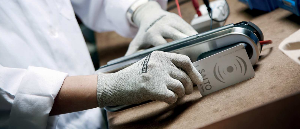
Functional test in manufacturing