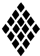
Diamond Deck Grip