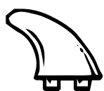
FCS Tri Fin Set