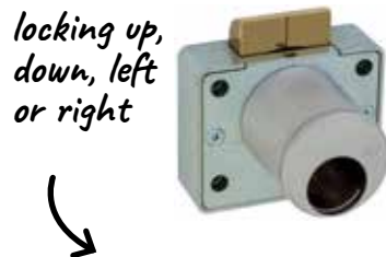
Latching Cupboard Lock