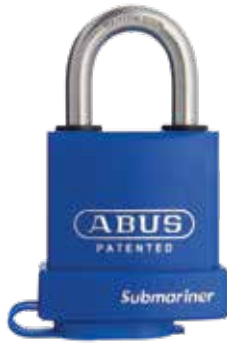
ABUS Submariner Padlock DP KD 8mm Stainless Steel Shackle