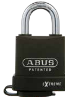
ABUS Padlock KD 8mm Dia Nano Plated Shackle