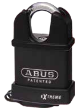
ABUS Padlock KD 8mm Dia Nano Plated Closed Shackle