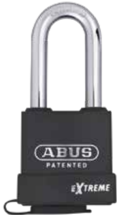
ABUS Padlock KD DP 11mm Dia Nano Plated Shackle

ABUS is your answer for outdoor locking applications. The corrosive resistant internal components and state-of-the-art plating make these padlocks ideal for securing boats, gates, trailers, bikes and caravans.