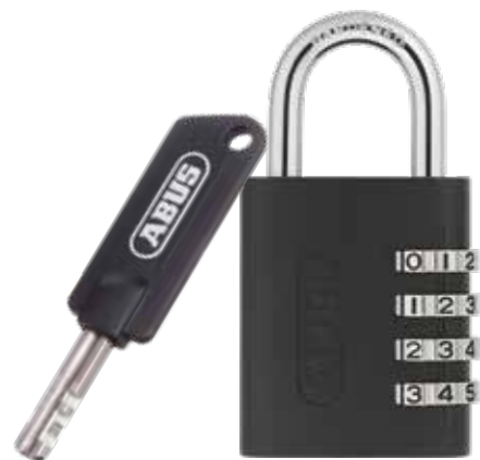
158KC45AP050, 158KC45AP051, 158KC45AP052