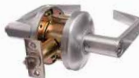
70mm Entrance Leverset EV6000SC70