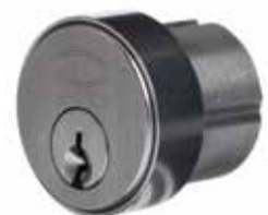
Threaded Body Round Cylinder BRM80466SCKD