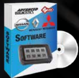
Advanced Diagnostics SMART Pro Software for Nissan Mitsubishi Renault SD756299AD

A recent update to SMART Pro Nissan software (ADS2326) extends coverage to a number of late model 2020 – 2025. Where applicable in all keys lost situations the ADC2017 cable is required and connects directly to the vehicle BCM.