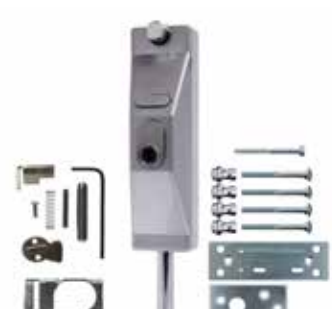
ADI lock bolt 5004 SC less barrel, sub assembled 44142009