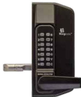
BL3430 BTB Keypad/Lever BL3430MGPROECP