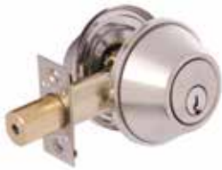
Double Cylinder Urban Deadbolt D362B

BRAVA has an extensive range of commercial locking products to meet even the most demanding customer requirements. Whether its enhancing or upgrading their security for their commercial premises you can trust BRAVA to have what you need. The range includes heavy duty deadbolts, commercial knobsets and leversets, and high quality commercial cylinders.