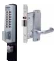
Selector® 3772 Short Backset Key Override DX Digital Mortice Locks