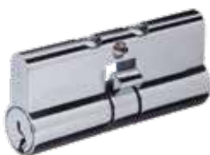
6 Pin Double Euro Cylinder BRM905551CP