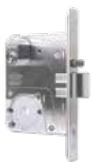
Selector® 3770 MkII Series Mortice Locks