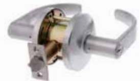
70mm Entrance Leverset EV8000SC70