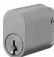
LW5 Oval Cylinder 5070USCKD