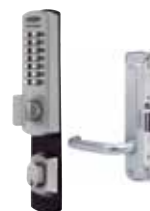
Selector® 3782 Short Backset Key Override DX Digital Mortice Locks