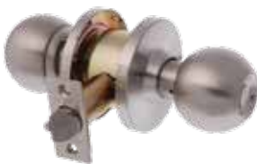
70mm Entrance Knobset EA3000SS70