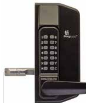
BL3400 Keypad/Lever BL3400MGPROECP