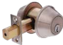
Double Cylinder Metro Deadbolt BP210LISS