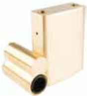
P/LOCK 83/40 L/SHK/PLUG 8340NBETCH