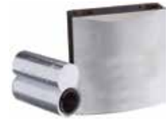
P/LOCK 83/50 L/SHK/PLUG 8350NBETCH