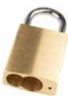
P/LOCK 83/40 L/CYL 8340NLCETCH