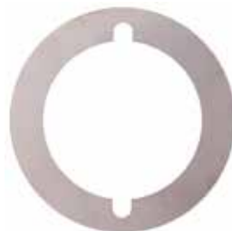
BDS Scar Plate suit EV 8000 O/D 85 mm FS8000