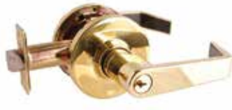
Metro Entrance Lever Polish Brass (cylindrical)