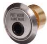
CYL RIM RC341 6P L/PLUG RC341SCLPETCH