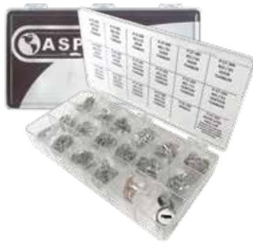
ASP Keying Kit A17-117 Fiat (SIP22)

Suit Fiat and Alfa Romeo utilising SIP22 profile DE Code Series