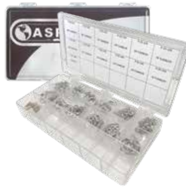
ASP Keying Kit A25-104 Peugeot Citroen (VA2)

Suit Peugeot Citroen utilising VA2 profile