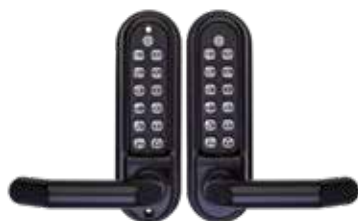
Digital Lock 5051 M/Grade Pro Black Lever/Lever BTB ECP