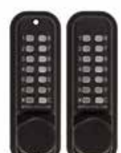
Digital Lock 2621 M/Grade Pro Lever/Lever BTB ECP