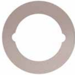
BDS Scar Plate suit 530 O/D 83 mm FS530