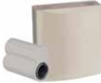
P/LOCK 83MAR/45 L/SHK/PLG 83MAR45NBETCH