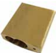
P/LOCK 83/45 L/SHACKLE L/CYL 8345NLSLCETCH