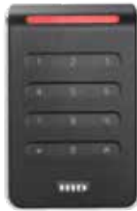
Signo 40K, Wall Switch Mounting, Keypad Support (Capacitive)

20KNKS020002BL 20KNKS0100001H 20KNKS00000000