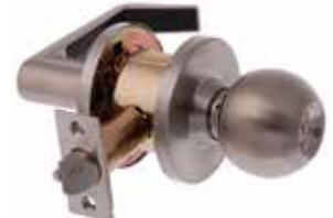
Metro Entrance Knob/Lever Satin Chrome (Cylindrical)