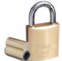
P/LOCK 83/45 L/PLUG 8345NLPETCH