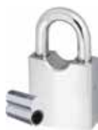
P/LOCK 83/55 L/PLUG 8355NLPETCH