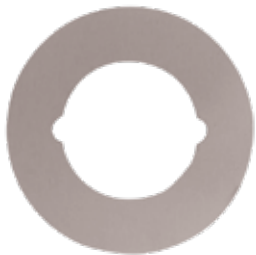
BDS Scar Plate suit 3000 O/D 98 mm FS3000