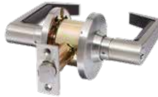
Metro Entrance Lever Chrome Plate (cylindrical)