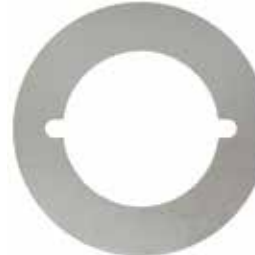
BDS Scar Plate suit EV 8000 O/D 98 mm FS800098