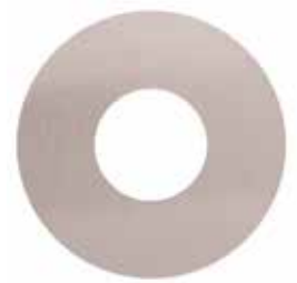
BDS Scar Plate suit 201 O/D 70mm FS201