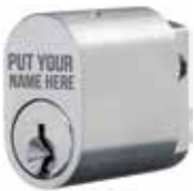
OVAL CYL SC KD AB570ETCHSKD