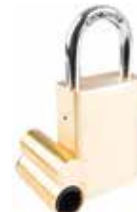
P/LOCK 83/40 L/PLUG 8340NLPETCH