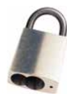
P/LOCK 83ALIB/40 L/CYL 83ALIB40LCETCH