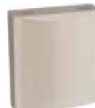
P/LOCK 83MAR/45 L/SHACKLE L/CYL 83MAR45LSLCETCH