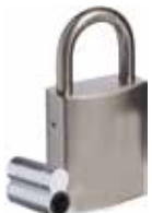
P/LOCK 83ALIB/40 L/PLUG 83ALIB40LPETCH