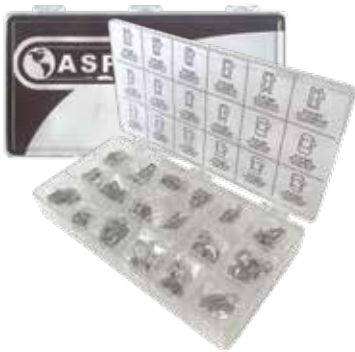
ASP Keying Kit A31-112 Volkswagen Audi Group (HU162)

Suits various Volkswagen Audi Group from 2015+ utilising HU162