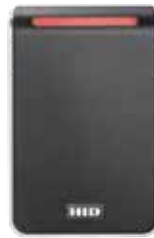
Signo 40 Wall Switch Mounting

40KNKS020002BL 40KNKS0100001H 40KNKS00000000