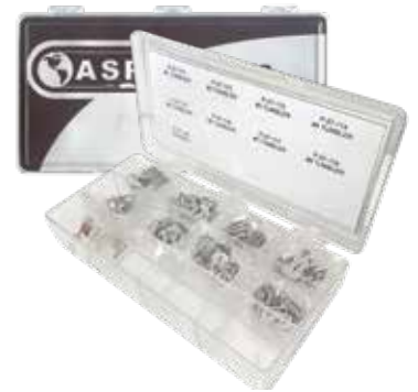
ASP Keying Kit A27-102 Renault (VA2)

Suit Peugeot, Citroen, Renault, Smart & Others using VA2 profile