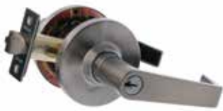
Metro Entrance Lever Satin Chrome (cylindrical)