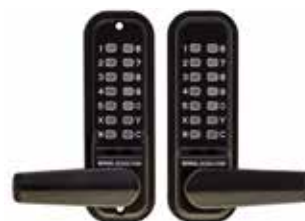
Digital Lock 4441 M/Grade Pro Lever/Lever BTB ECP