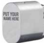
OVAL CYL SC DUMMY AB570ETCHSCD