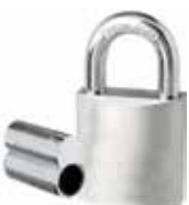
P/LOCK 83/50 L/PLUG 8350NLPETCH