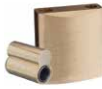
P/LOCK 83/45 L/SHK/PLUG 8345NBETCH