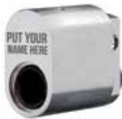
OVAL CYL SC L/PLU AB570ETCHSCLP