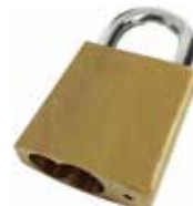
P/LOCK 83/45 L/CYL 8345NLCETCH