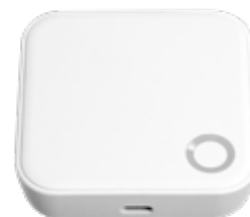
McGrath G5 Gateway, Type-C USB, WIFI 5GHz and 2.4GHz

The McGrath Locks G5 Gateway is used to connect your devices to a WIFI network. The gateway enables you to remotely control your lock or device via TTLock. You can add, remove access rights and lock and unlock your device from anywhere in the world.