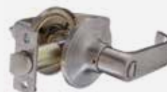
LN PRIVACY LN601B