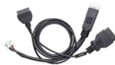
Advanced Diagnostics SMART Pro Bypass Cable for Toyota SD756924AD