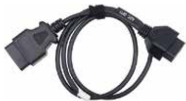
Advanced Diagnostics SMART Pro Chrysler Group 2018 Star Connector Cable ADC2011 SD753084AD

manufacturer security does not allow for conventional OBD programming. These solutions provide for a safe, secure and easy to use approach negating the need for component removal or spiking wiring looms.