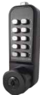
Digital Lock 1706 MG Pro