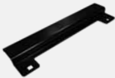
With kink for electric strike BP6860ELECBLK