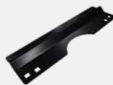
Suit EV8000, EU6000 & EV6000 lever sets BP6860E7BLK