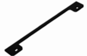
Suit mortice lock blocker plate BPPMMB