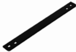
Suit blank blocker plate BPPBMB