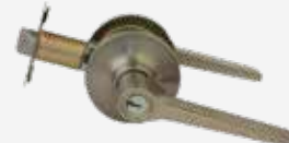
LE ENTERANCE LE600B