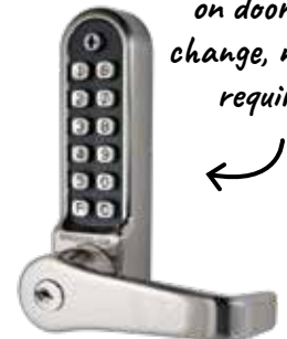
Digital Lock 5701 SC