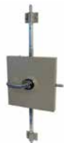
ADI 3-Point Locking Bar LB712 LH O/OUT ADILB712L