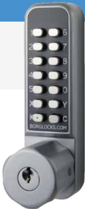
Digital Lock 2701 SC Knob