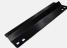
No cutout BP6860BBLK