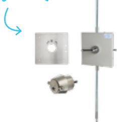
ADI 3-Point Locking Bar LB712-1 LH O/OUT ADILB7121L