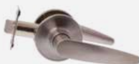
LH PASSAGE LH603B

Choose BRAVA Urban leversets for proven reliability!