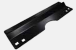
Suit entrance set BP6860EBLK