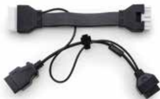
Advanced Diagnostics SMART Pro Bypass Cable for Renault SD755649AD