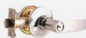
LYR ENTERANCE LYR600B