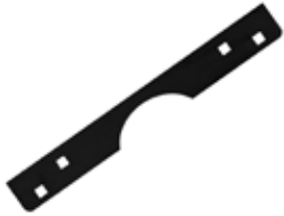
Suit EU and EV entrance set BPPE700MB