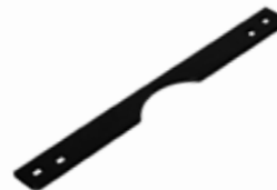
Suit entrance set BPPEMB