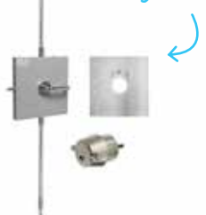
ADI 3-Point Locking Bar LB712-1 RH O/OUT ADILB7121R