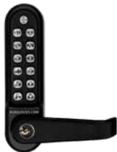
Digital Lock 5701 MG Pro