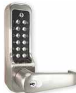
Digital Lock 7701 SC