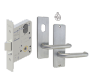
KIT4 MS2 Classroom Lock Kit 600 Series