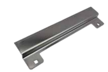
BDS Blocker Plate BP6860ELEC Mild Steel 09351189