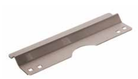
BDS Blocker Plate (Cut-out) BP7860E SSS suit Entrance Set 06001048