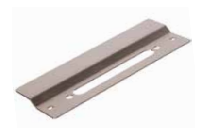
BDS Blocker Plate CL3580 SSS suit Lockwood 3580 Series CL3580