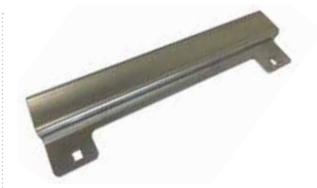
BDS Blocker Plate BP7860ELEC Stainless Steel 09351187