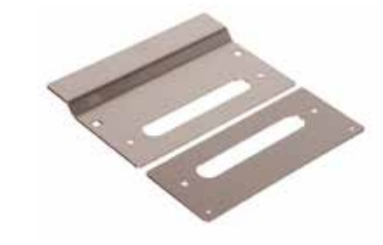
BDS Blocker Plate CL3570 suit Lockwood 3570 Series CL3570