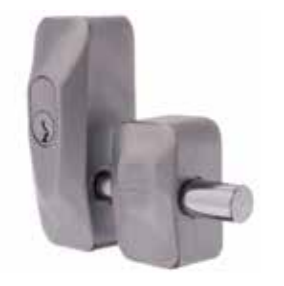
ADI BLOCKLOK 444DD Double, Satin Chrome 44142040