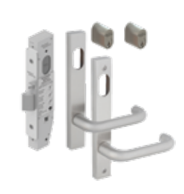
DKSB2212KIT1 SB2212 Double Cylinder Lock Kit