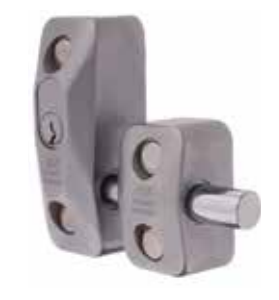
ADI BLOCKLOK 444DDFM Double Front Mount, Satin Chrome 44142045