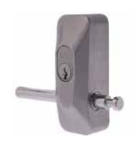
ADI BLOCKLOK 444 Single, Satin Chrome 44142030