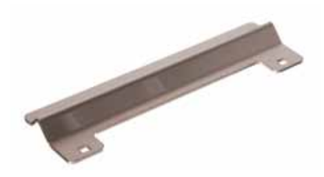
BDS Blocker Plate BP7860M SSS suit Mortice Lock 09351115

Remove the stress and headache from jobs, save time and money with BDS Security Products. With a range of blocker plates to suit just about every job. Available in stainless steel or zinc plated mild steel with optional packing plates.