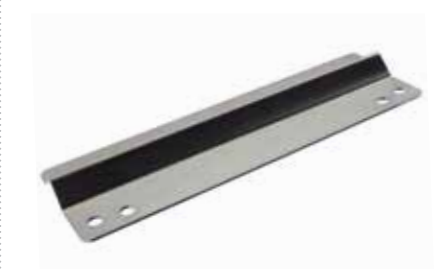
BDS Blocker Plate (No Cut-out) 6860B 09351114

For more information on the full range of BDS blocker plates please visit lsc.com.au