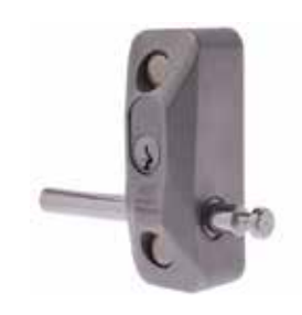
ADI BLOCKLOK 444FM Single Front Mount, Satin Chrome 44142035