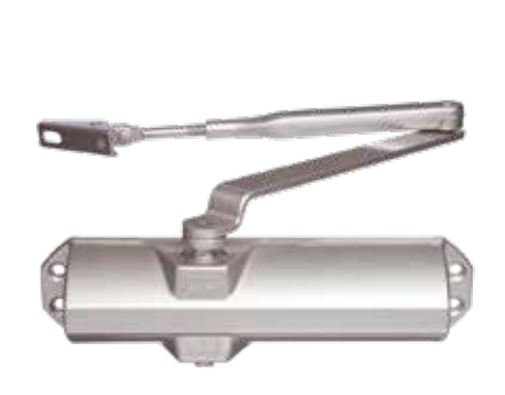
TS68 EN2-4 Door Closer

Whether for private homes or contemporary office buildings, door closer systems from dormakaba are intelligent, integrated access solutions that combine consistency, convenience, design and premium quality. The wide-ranging product portfolio satisfies a broad spectrum of functional requirements and thus offers solutions for almost any individual door situation.