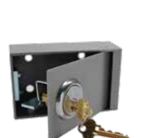
Key Box Hinged with 201 Cylinder NMB1112201

ADI security wall mounted key boxes are small, strong and reliable. They are ideal for storing keys and access cards for easy and quick access. ADI NMB Security boxes are supplied in various configurations to suit your specific needs We have our two main fully assembled boxes fitted with either a 201 cylinder or a cam lock. Other configurations include less cylinder to accommodate your requirement.