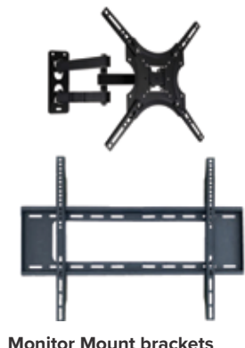
Monitor Mount brackets