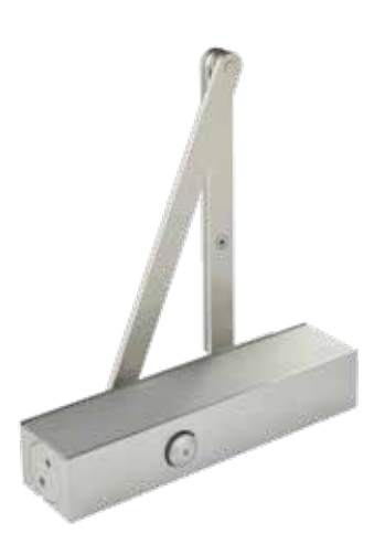
TS83 EN3-6 Door Closer