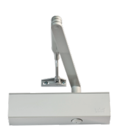
TS73 EN1-4 Door Closer