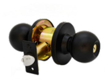
BRAVA Metro EA Series Classroom Knob Set 70mm Backset