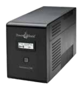
PowerShield Defender 1200VA