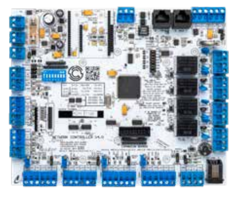
Network 4 Door Controller

Complete your access control system with a Neptune keypad. These 12-button keypads feature an integrated reader for fob and card access. Available in a range of finishes and formats, Neptune keypads are a perfect addition for your access control system.