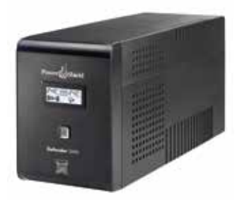
PowerShield Defender 2000VA