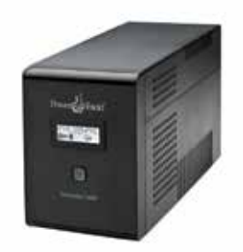
PowerShield Defender 1600VA