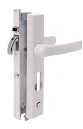
Austral Ultimate Lockset White (Replaces HD8)