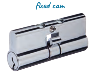
6 Pin Double Euro Cylinder BRM905551CP