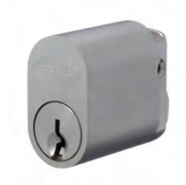
LW5 Oval Cylinder 5070USCKD