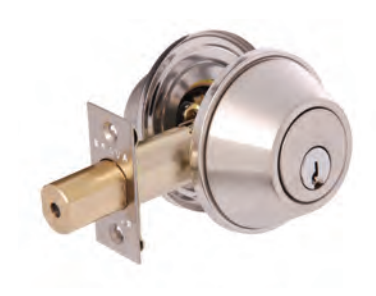
Double Cylinder Urban Deadbolt

BRAVA has an extensive range of commercial locking products to meet even the most demanding customer requirements. Whether its enhancing or upgrading their security for their commercial premises you can trust BRAVA to have what you need. The range includes heavy duty deadbolts, commercial knobsets and leversets, and high quality commercial cylinders