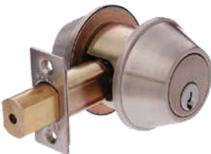
Double Cylinder Deadbolt BP210LISSS