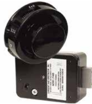
Inside view 2890440MA