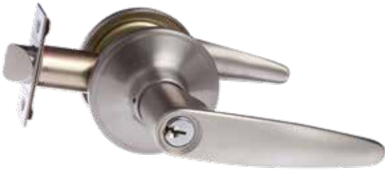
Entrance Leverset LH600B