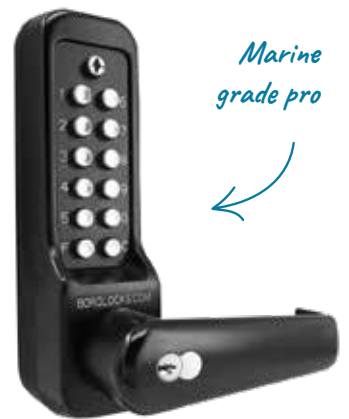
Borg Marine Grade Digital Lock with ECP BL7701MGPROECP