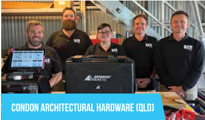
CONDON ARCHITECTURAL HARDWARE (QLD)

The team from Condon Architectural Hardware are pictured with their new auto key cutting & programming equipment; a new Silca Futura Pro, SMART Pro, SMART Aerial and Silca SRP.