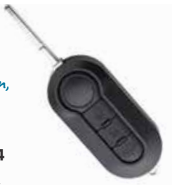
Suit Citroen, Fiat, Iveco

Silca offer a comprehensive and growing range of automotive remote, prox and slot keys. These high quality keys are a reliable and economical alternative to the OEM version. Download the complete catalogue from any of the LSC product webpages.