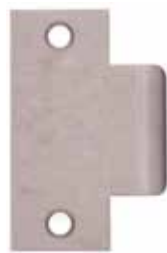
BDS Strike Plate No Latch Cut Out, Suit 3572 70x30mm 3572STRIKENC