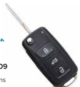
Suit Volkswagen Group