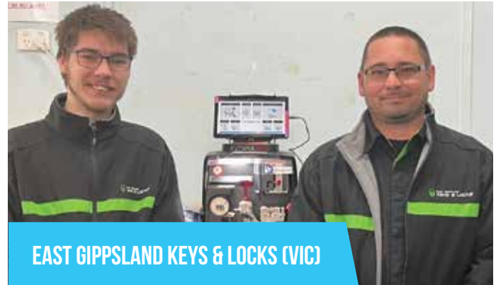
EAST GIPPSLAND KEYS & LOCKS (VIC)

The team from Condon Architectural Hardware are pictured with their new auto key cutting & programming equipment; a new Silca Futura Pro, SMART Pro, SMART Aerial and Silca SRP.