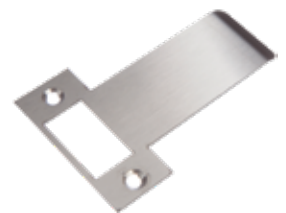
BDS Long Lipped Strike 75mm, Extended Lip 09351193