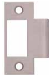
BDS Strike LW3572STD, Suit 3570 Series 09351380