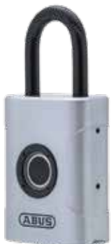
Abus Padlock Touch™ Biometric Fingerprint Weather Resistant Silver Display Pack - 57/45