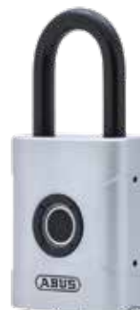
ABUS Padlock Touch™ Biometric Fingerprint Weather Resistant Silver Display Pack - 57/50