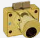
Latching Cupboard Lock (U, D, L or R) BRL78VLCAPB