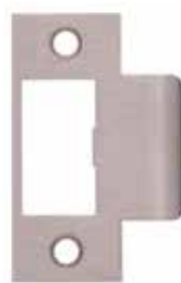
BDS Strike to suit Mortice Lock with Adjustable Tab for Latch SSS 11351173