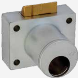
Dead-latching Cupboard Lock BR850LCASC