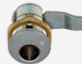
Cam Lock BR820LCSC