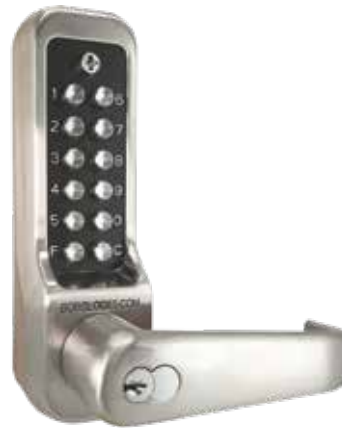
Borg Heavy Duty Digital Lock with ECP BL7701SSECP